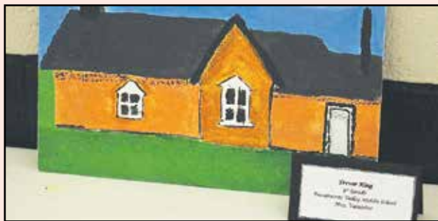
The Art Show