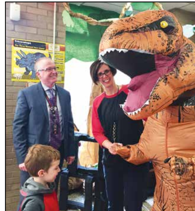
Litaracy Night 2018