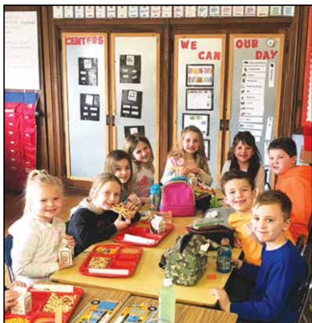
The Lunch Bunch