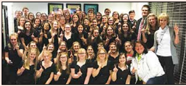
TVHS Concert Band received a Superior rating at State.

For the second consecutive year, the TVHS Concert Band received a Superior Rating at the Ohio Music Education Association (OMEA) State Competition in April.