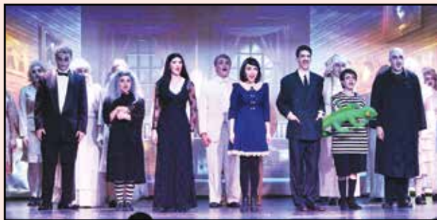
The Addams Family