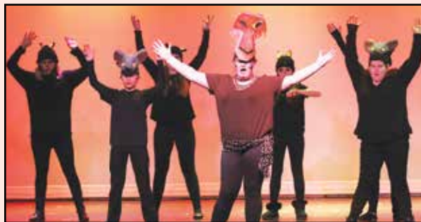
The Lion King Kids