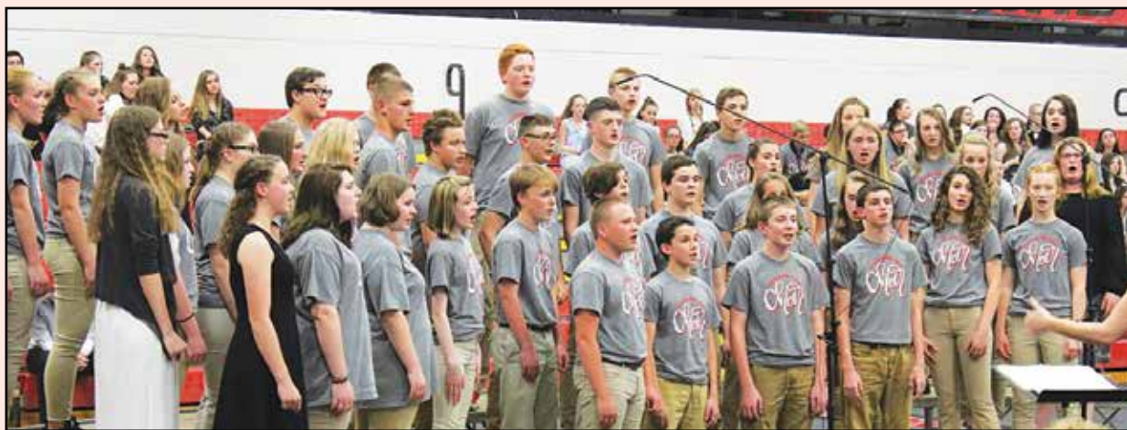
Middle School Choir