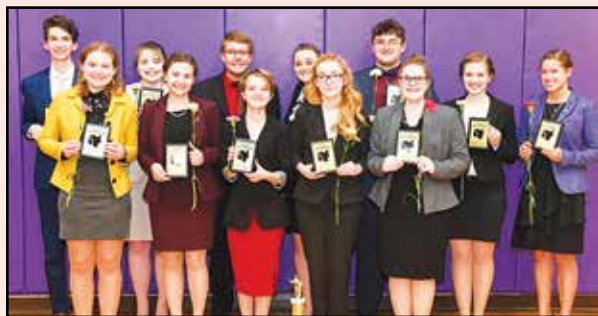
Speech and Debate